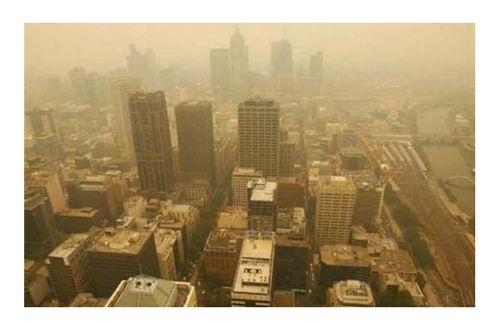
Figure 1: Melbourne's central business district affected by bushfire smoke

Windblown dust and accumulation of combustion particles in calm, highly stable air also resulted in some additional days when the particle standards were not met. At other times, Victoria's air was generally clean