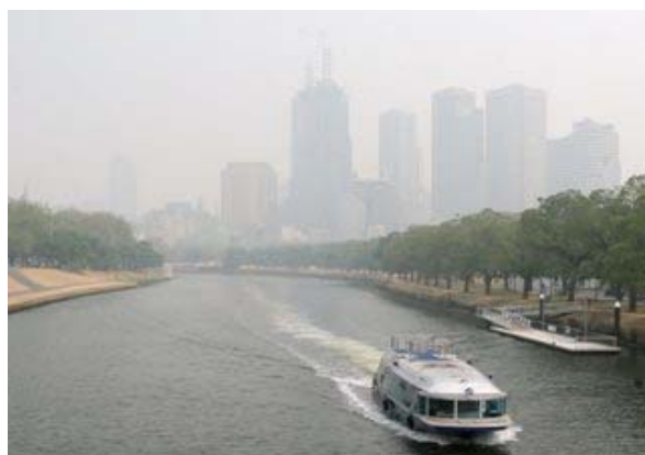
Figure 1: Melbourne's CBD affected by bushfire smoke during December 2006.

The increased use of motor vehicle fuels that emit less greenhouse gas is desirable and likely in future. Changes in dominant motor vehicle fuels used will impact particle levels. Increased use of diesel fuel may increase emissions of particles from motor vehicles, while the use of biodiesel may help to reduce levels, as it emits fewer particles than standard diesel (Beer et al. 2007, Sharma et al. 2008). The effect on air quality from changing fuel use will depend on the actual mix of fuels used.