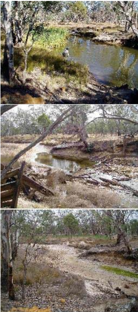
Figure 3: Lower Wimmera River, 2005, 2006 and 2007 (top to bottom).

Climate change is expected to reduce many rivers to isolated pools. These pools are vital for the continued survival of aquatic species during times of drought.