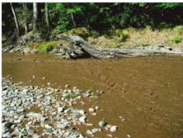
Figure 4: A sediment slug in the Ovens River at Whorouly following bushfires in 2003.

Heavy rains soon after bushfires can cause sediment slugs that scour and smother the in-stream habitat, reduce the amount of dissolved oxygen and light penetration, and clog the gills of fish.