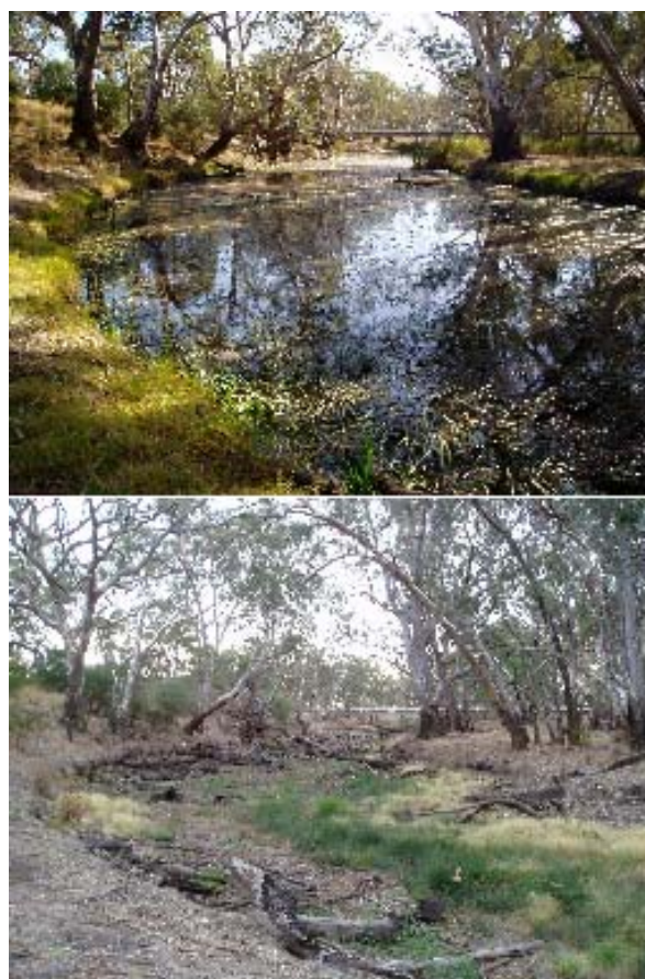
Figure 2: Wimmera River, autumn 2005 (top) and autumn 2007 (bottom).

Reduced rainfall is expected to cause many Victorian rivers to remain dry for long periods.